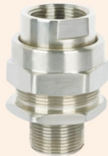
Steel pipe wiring